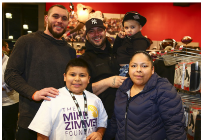
Harrison Smith and other teammates joined 25 children from Children's Minnesota for a holiday shopping event at DICK'S Sporting Goods hosted by the Mike Zimmer Foundation in 2019.

Smith matched his single-season career-high with his third sack of the season in Week 14 against Pittsburgh. He extended his franchise record of sacks among defensive backs to 16.5. In Week 12 at San Francisco, Smith tallied his 29th career interception, moving him into third all-time in career interceptions by an active defensive back since 2011. He also recorded 11 tackles on the day, ranking as the second-most of his career and the most since Dec. 2, 2012, against the Packers when he recorded 11. Smith extended his team record for most sacks by a DB to 15.5 with his full sack versus Green Bay in Week 11. Smith's 16.5 sacks are the second-most among defensive backs since entering the league in 2012, trailing only Seahawks S Jamal Adams (21.5).