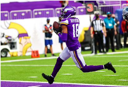
Vikings rookie WR Justin Jefferson became the fifth rookie in the Super Bowl era to record 1,000 receiving yards in a season and only the sixth rookie to total 1,000 or more yards in the first 12 games of a season in NFL history in Week 13.