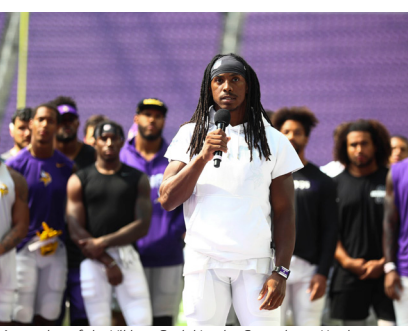
A member of the Vikings Social Justice Committee, Harris addressed media members on social justice causes after Minnesota's August 28th practice at U.S. Bank Stadium.

at Chicago, 11/18/18 2 vs. Atlanta, 9/8/19 2