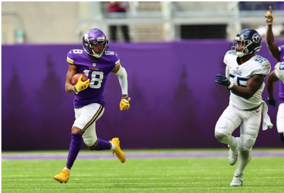
Vikings rookie WR Justin Jefferson's 104 yards receiving in the first half vs. Tennessee ranks fourth-most in a half in the NFL this season and leads all rookies. Since 2015, rookies have recorded 104 yards or more in a half 18 times with Jefferson being the only Viking to do so.