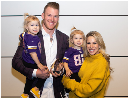
From his End Zone project and holiday-themed Halloween, Thanksgiving and Christmas parties at U of M Masonic Children's Hospital to football camps for kids and countless other charities, Kyle Rudolph has stood tall as the Vikings' Community Man of the Year for three consecutive seasons (2017-19).