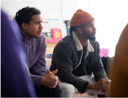
Advocates for social change and members of the Vikings Social Justice Committee, Kendricks and Ameer Abdullah visited with representatives of All Square in 2019 and will continue to build the relationship the team has with the organization in 2020.

Following the 2019 season, Eric Kendricks was named to his first Pro Bowl and earned Associated Press First-Team All-Pro honors, becoming the first Vikings linebacker to be named All-Pro since Chad Greenway (Second Team) in 2012. Through five weeks of the 2020 season, Kendricks is tied for the NFL lead in tackles with 53.