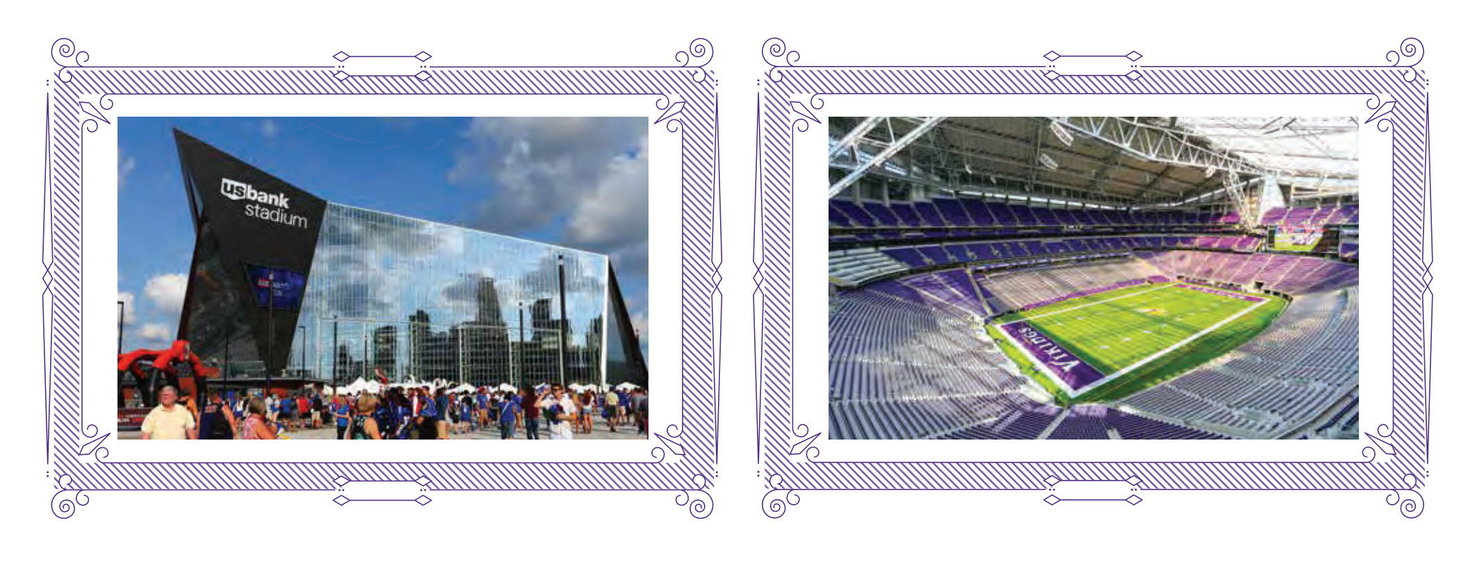
This is U.S. Bank Stadium and the Minnesota Vikings play football in this stadium. I will be going to a football game here.