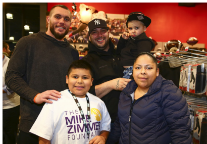
Harrison Smith and other teammates joined 25 children from Children's Minnesota for a holiday shopping event at DICK'S Sporting Goods hosted by the Mike Zimmer Foundation in 2019.

Smith matched his single-season career-high with his third sack of the season in Week 14 against Pittsburgh. He extended his franchise record of sacks among defensive backs to 16.5. In Week 12 at San Francisco, Smith tallied his 29th career interception, moving him into third all-time in career interceptions by an active defensive back since 2011. He also recorded 11 tackles on the day, ranking as the second-most of his career and the most since Dec. 2, 2012, against the Packers when he recorded 11. Smith extended his team record for most sacks by a DB to 15.5 with his full sack versus Green Bay in Week 11. Smith's 16.5 sacks are the second-most among defensive backs since entering the league in 2012, trailing only Seahawks 5 Jamal Adams (21.5).