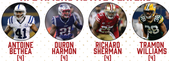
ANTOINE BETHEA [4]