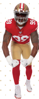
DEFOREST BUCKNER [7.5 SACKS]