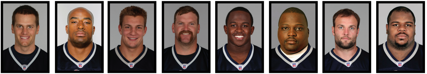
Tom Brady 7th Selection Andre Carter 1st Selection Rob Gronkowski 1st Selection Logan Mankins 4th Selection Matthew Slater 1st Selection Brian Waters 6th Selection Wes Welker 4th Selection Vince Wilfork 4th Selection

FOXBOROUGH, Mass. – For the second year in a row, eight members of the New England Patriots have been selected to the Pro Bowl.