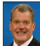
Colts Owner & CEO Jim Irsay

This season will mark the 40th anniversary of the Irsay family owning the Colts. In July, 1972, the Colts came under new ownership as Robert Irsay acquired the club from Carroll Rosenbloom in exchange for the Los Angeles Rams. In 1997, Jim Irsay became the team's Owner & CEO. Since the Irsay family acquired the Colts, the team has recorded 297 victories while logging 17 playoff appearances, two Super Bowls and one Super Bowl win (XLI) in 2006.