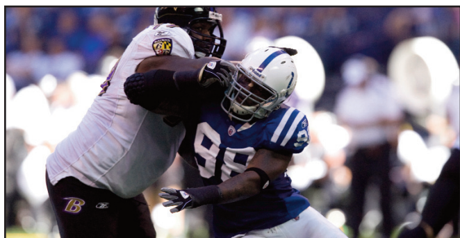
Robert Mathis recorded one of his two career three-plus sack games against Baltimore on October 12, 2008.

Robert Mathis has totaled 79.5 career sacks in his nine-year career with the Colts, which ranks second in club history behind Dwight Freeney's 99.5. In 2005, he registered a sack in 11 of 13 games and set an NFL record with sacks in eight consecutive contests to start a season. Mathis has 18 multiple-sack games in his career and two three-plus sack games. He had a streak of three consecutive multiple-sack games in 2008 at San Diego (11/23), at Cleveland (11/30) and vs. Cincinnati (12/7).