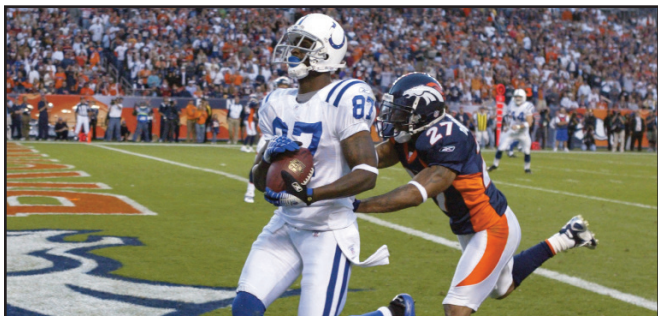
Wide receiver Reggie Wayne caught three touchdowns in a 34-31 victory at Denver in 2006.