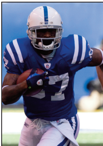
Reggie Wayne ranks second in the franchise in receptions, yards and touchdowns by a wide receiver.

Wide receiver Reggie Wayne contributed with his second-highest receiving yardage total last season (1,355), his best since 2007 when he logged his career-high 1,510 yards. Dating back to 2004, Wayne has compiled 1,000-plus receiving yards in each season and leads all active wide receivers for most consecutive 1,000-plus yard campaigns with seven.