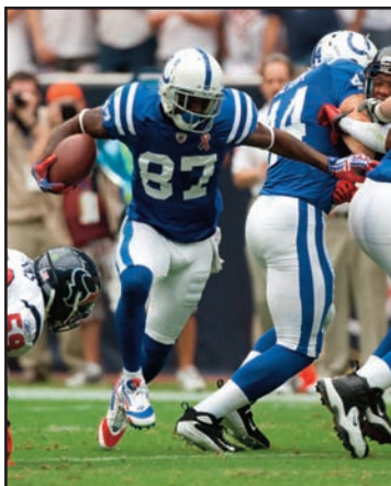
Wide receiver Reggie Wayne makes one of his seven catches against Houston in Week 1.

Wide receiver Reggie Wayne led the Colts in receiving with seven catches for 106 yards and one touchdown in the team's season opener at Houston. His receiving total marked his 36th regular season contest reaching the 100-yard plateau. Quarterback Kerry Collins found Wayne in the back of the endzone for a six-yard strike in the fourth quarter, which signified the team's first points of the 2011 campaign. The