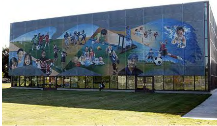
The new mural on the side of the East Oakland Sports Complex.