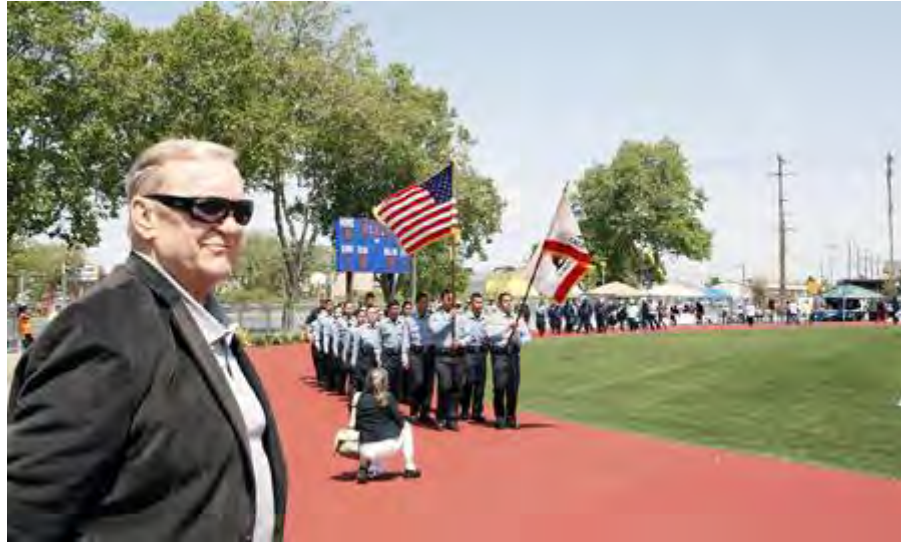
HOF Jim Otto looks on as the local youth sports teams, honor guard, local dignitaries, and community groups parade around the new field.

100-yard run?' Or, 'Remember that corner goal that Susie kicked?' These are the memories that you'll have - you'll have these of your field, the thing you worked to get in your community."