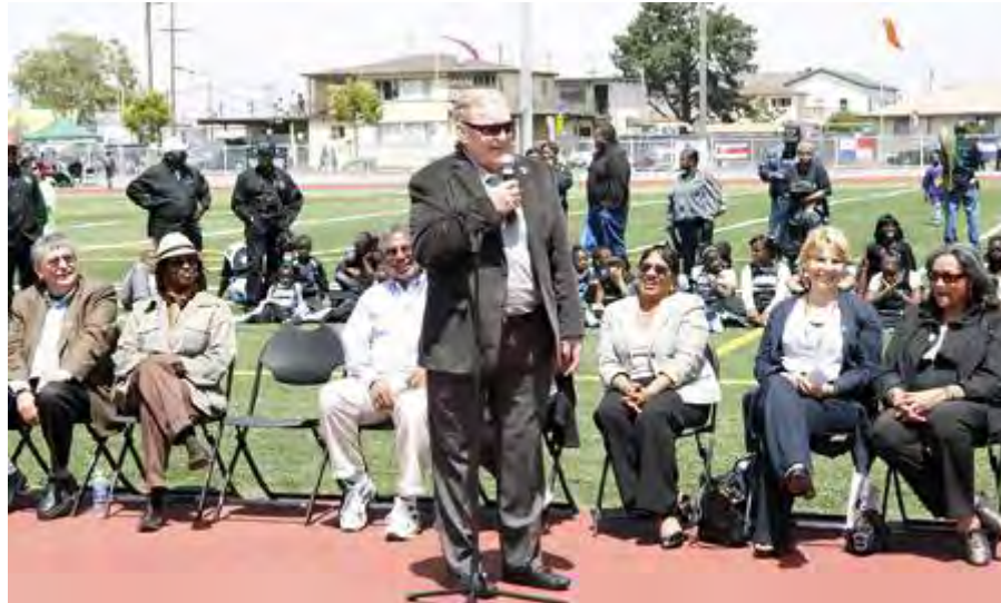
Hall of Fame Center Jim Otto speaks on behalf of The Oakland Raiders at the grand opening of Dr. Martin Luther King, Jr. Park in Richmond, Calif.

Oakland Raiders Hall of Fame Center Jim Otto attended the grand opening of Dr. Martin Luther King, Jr. Park in Richmond, Calif. The Raiders helped fund the park through a grant in 2009.