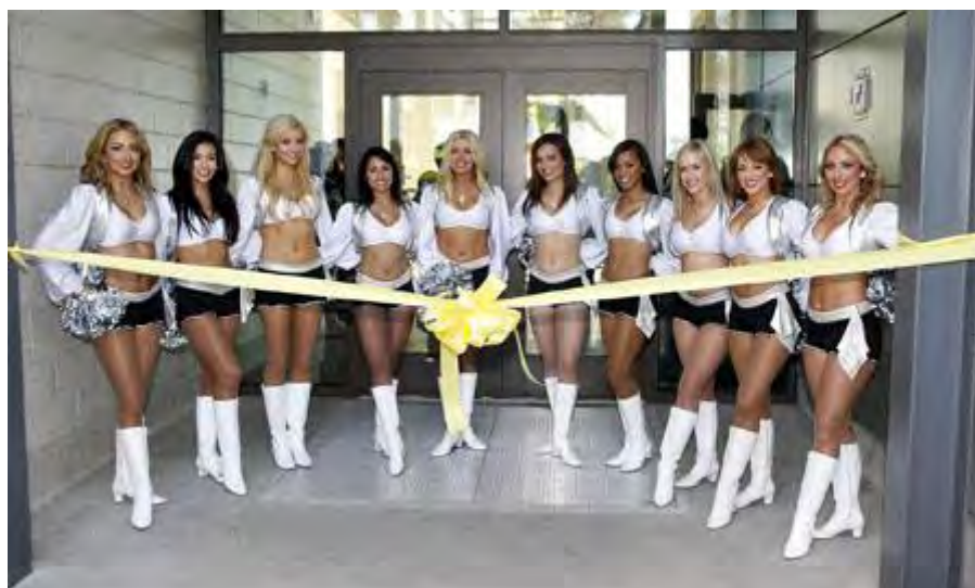
The Raiderettes get ready to help cut the ribbon at the Grand Opening ceremony.