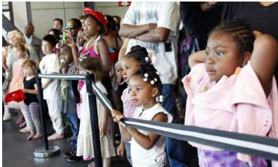
Kids and their families lined up to watch the Raiderettes.