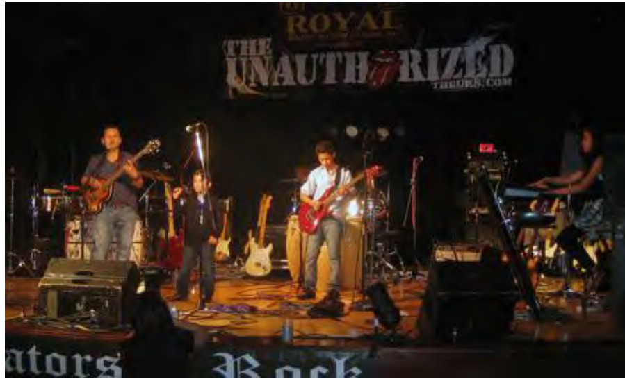
Gladiators of Rock perform for the guests at the ROYAL Unity Benefit Concert.