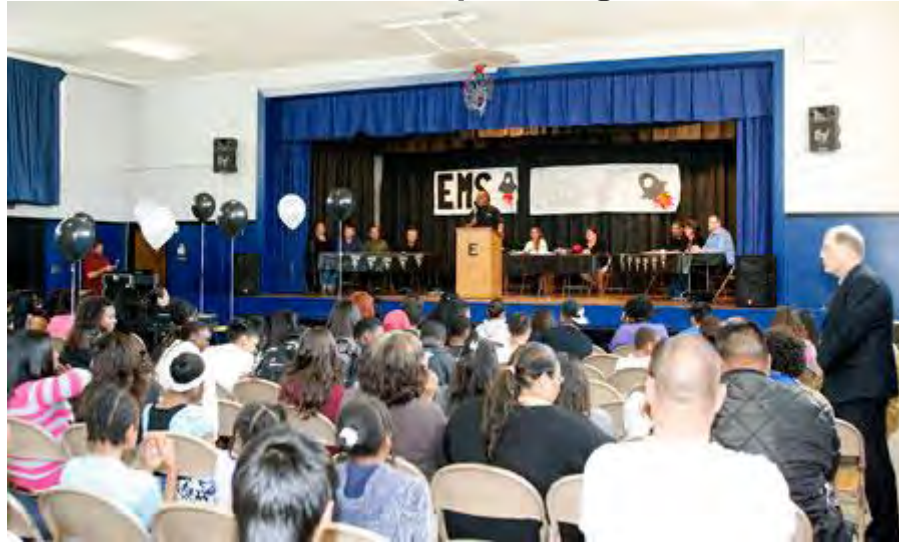
Students, parents, and teachers listen intently to Raiders Head Coach Hue Jackson at Edendale Middle School.

Head Coach Hue Jackson spoke to student athletes at Edendale Middle School about the importance of education and pursuing dreams.