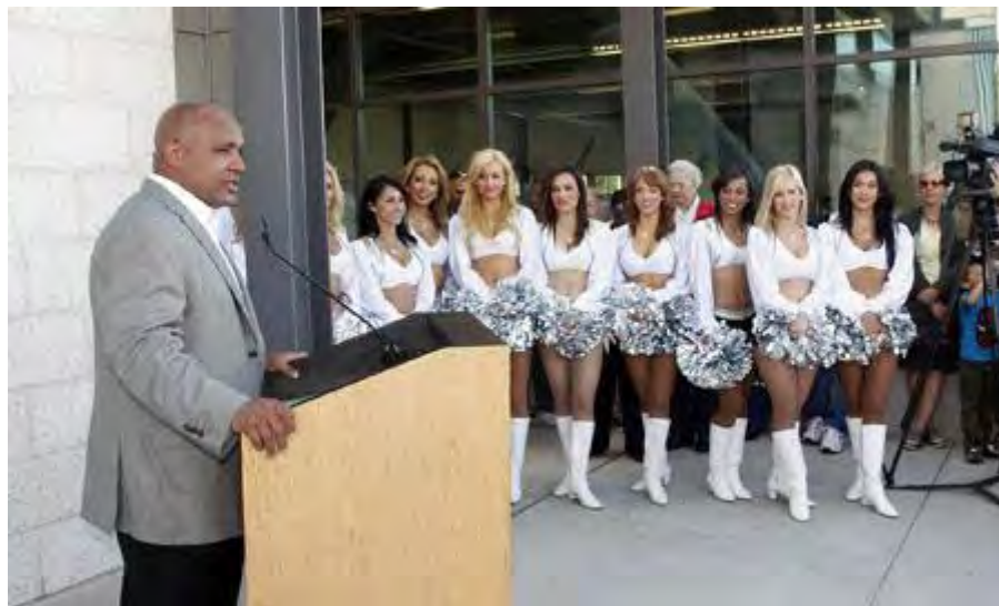
Raiders Head Coach Hue Jackson speaks to the crowd.