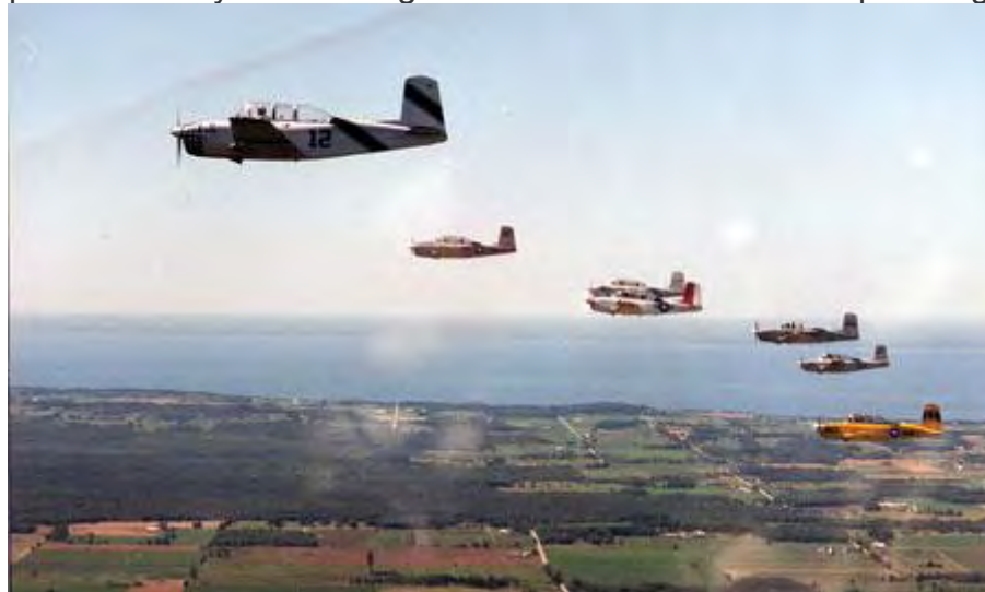
The Raiders airplane in formation.

But the Raiders had a secret weapon -- George Blanda. He made every field goal he tried that day. Every time he went for a field goal, the Raiders seemed confident they would score. They won that game with four George Blanda field goals stopping the unbeatable Dolphins for the first time. The Dolphins lost only one other game in 1973 and were champions again.