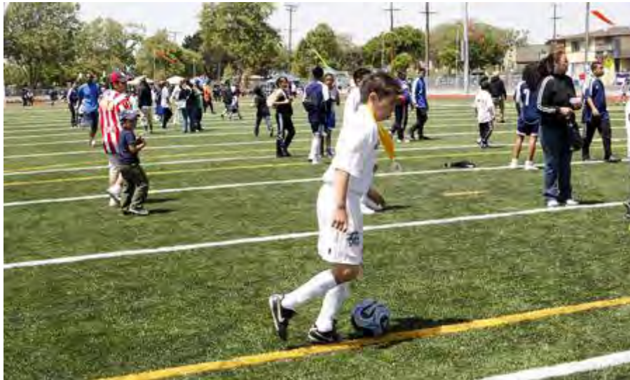
The local Richmond youth get to run on the new field for the first time.