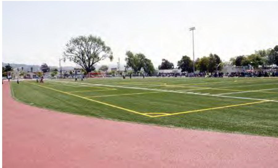
The Oakland Raiders, NFL, and LISC helped fund the new field.

The Richmond neighborhood councils — Coronado, Santa Fe, and Iron Triangle — worked together throughout the process to help the park come to life.