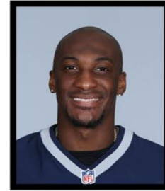
Aqib Talib 1st Selection

Four members of the New England Patriots have been selected to the 2014 NFL Pro Bowl. Quarterback Tom Brady, G Logan Mankins, WR Matthew Slater (special teams) and CB Aqib Talib have been selected to represent the New England Patriots in the 2014 NFL Pro Bowl on Jan. 26, 2014 at Aloha Stadium in Hawaii.