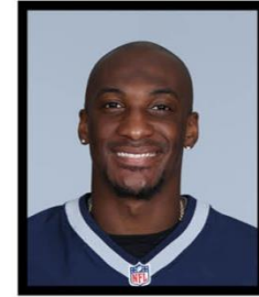
Aqib Talib 1st Selection

Four members of the New England Patriots have been selected to the 2014 NFL Pro Bowl. Quarterback Tom Brady, G Logan Mankins, WR Matthew Slater (special teams) and CB Aqib Talib have been selected to represent the New England Patriots in the 2014 NFL Pro Bowl on Jan. 26, 2014 at Aloha Stadium in Hawaii.