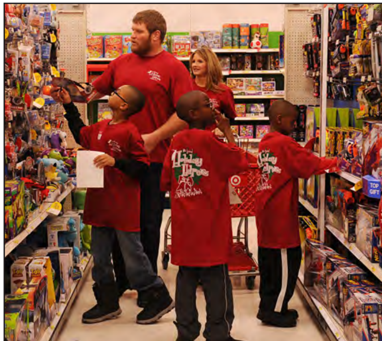
G Marshal Yanda