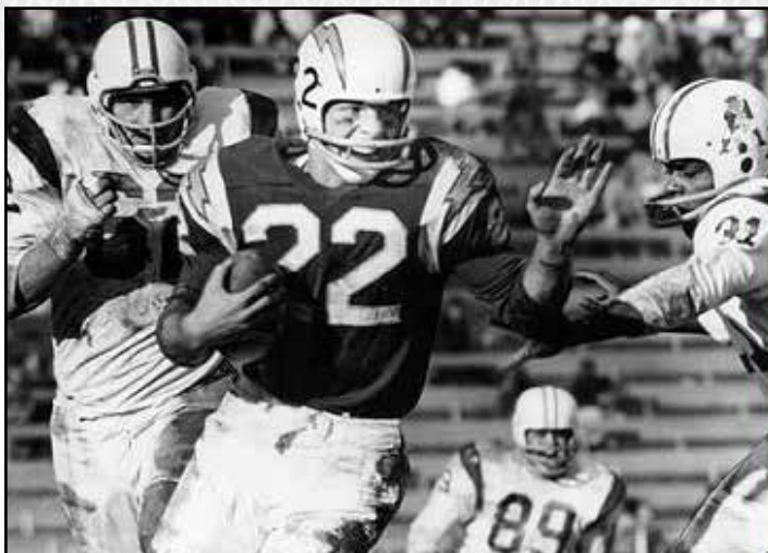
Chargers running back Keith Lincoln (No. 22) torched the Patriots for 206 rushing yards, 123 receiving yards and two total touchdowns.