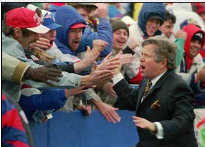
Robert Kraft got his first chance to celebrate a win with Patriots fans in Foxborough after New England bested Green Bay on a last-second field goal.