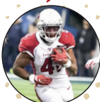
KENYAN DRAKE [7]