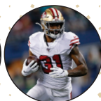
RAHEEM MOSTERT [7]