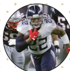
DERRICK HENRY [8]