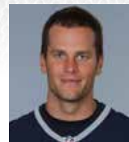
BRADY, CIRCA 2014

The 2014 version of Tom Brady has a slight edge on the 2000 version.