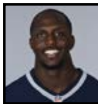
Devin McCourty 3rd Selection