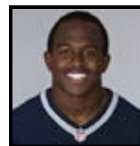
Matthew Slater 6th Selection

Four members of the New England Patriots have been selected to the 2017 NFL Pro Bowl. Quarterback Tom Brady, LB Dont'a Hightower, DB Devin McCourty and WR Matthew Slater (special teams) have been selected to represent the New England Patriots in the 2017 NFL Pro Bowl on Sun., Jan. 29, 2017, at Camping World Stadium in Orlando, Fla. All four players that have been selected are team captains. The Patriots have now had at least four players selected to the Pro Bowl in each of the last eight seasons - (2009-5, 2010-8, 2011-8, 2012-7, 2013-5, 2014-7, 2015-7 and 2016-5).