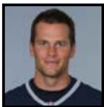
Tom Brady 12th Selection