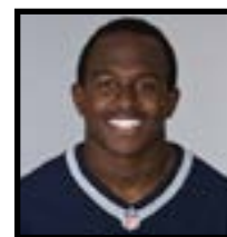
Matthew Slater 6th Selection

Four members of the New England Patriots have been selected to the 2017 NFL Pro Bowl. Quarterback Tom Brady, LB Dont'a Hightower, DB Devin McCourty and WR Matthew Slater (special teams) have been selected to represent the New England Patriots in the 2017 NFL Pro Bowl on Sun., Jan. 29, 2017, at Camping World Stadium in Orlando, Fla. All four players that have been selected are team captains. The Patriots have now had at least four players selected to the Pro Bowl in each of the last eight seasons - (2009-5, 2010-8, 2011-8, 2012-7, 2013-5, 2014-7, 2015-7 and 2016-5).