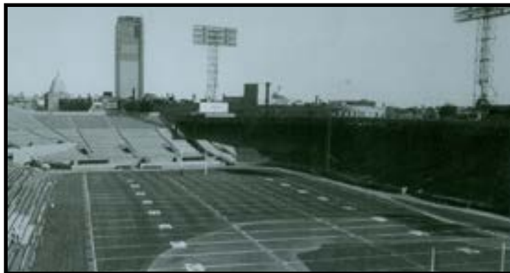
Fenway Park, Boston, Mass.