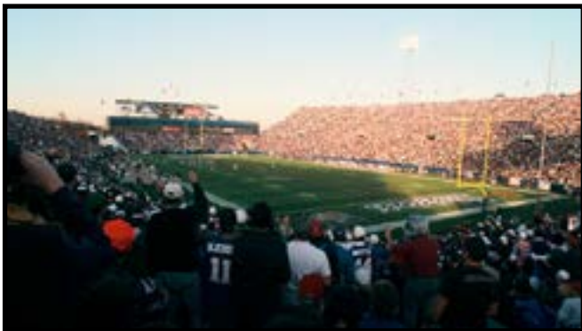
Harvard Stadium, Boston, Mass.