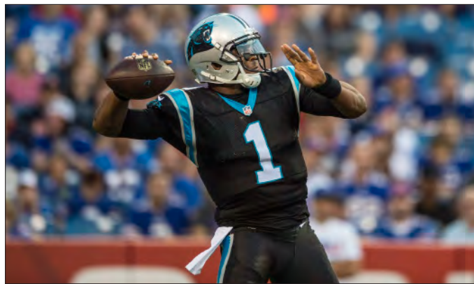
Quarterback Cam Newton ranks first or second in many of the Panthers all-time passing statistics.