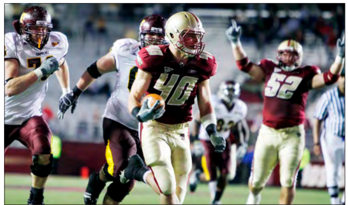
Panthers linebacker Luke Kuechly is one of several Panthers with New England area connections as he played college football at Boston College.