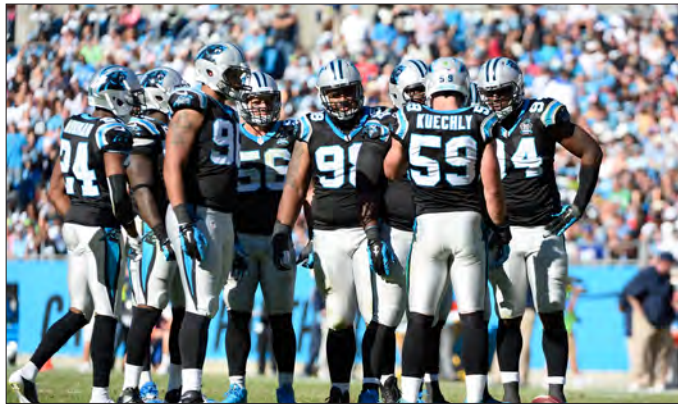
Carolina's defense finished in the top 10 for the fourth consecutive year in 2015. The Panthers are one of two teams to finish with a top 10 defense each of the last four seasons.

The Panthers also ranked among the league leaders in yards per play (second), total takeaways (first), interceptions (first), sacks (sixth) and opponent passer rating (first).