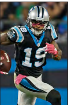
Ted Ginn, Jr.

In 2015, Ted Ginn, Jr. ranked second in the NFC and fifth in the NFL with a 10.3-yard punt return average on 27 returns with a long of 37. In each of the last six seasons, Ginn has stood fifth or higher in the NFC in punt return average.