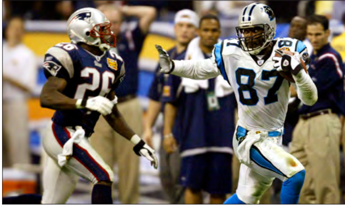
Muhsin Muhammad's 140 receiving yards in Super Bowl XXXVIII (2/1/04) are the most ever by a Panthers player vs. the New England Patriots.