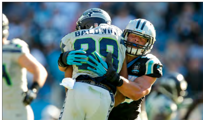
Linebacker Luke Kuechly has been among the NFL's tackle leaders in each of his four seasons. No one has more than his 591 stops since the start of 2012.