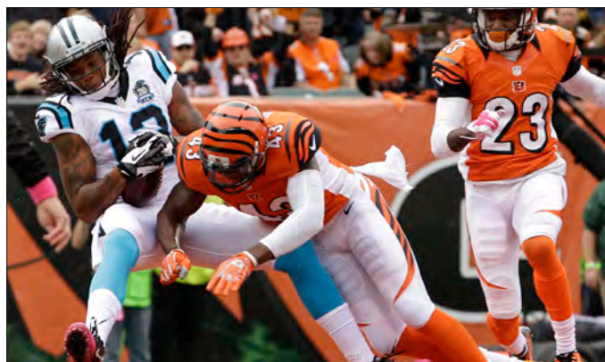
Kelvin Benjamin hauls in one of his nine touchdowns of the 2014 season at Cincinnati (10/12/14).

Benjamin produced three 100-yard receiving games in his rookie season. The three 100-yard games were the most by a rookie in Panthers history.