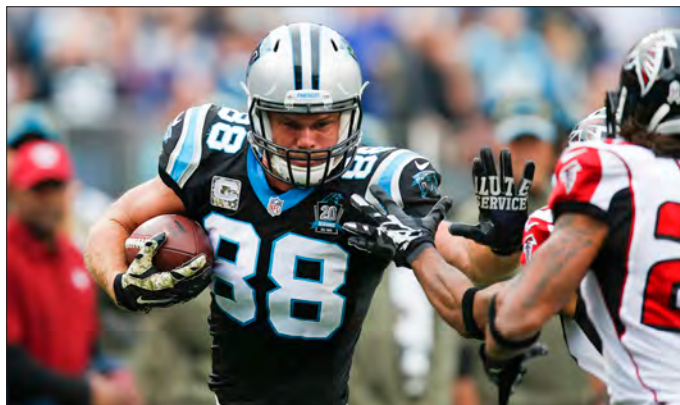
Greg Olsen is the first 1,000-yard tight end in Panthers' history, accomplishing the feat in consecutive seasons (2014 and 2015).