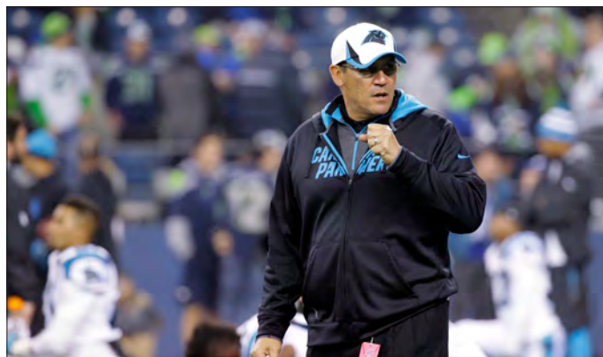
Ron Rivera's 19-5 record in December/January is tied for the best in the NFL since 2011.