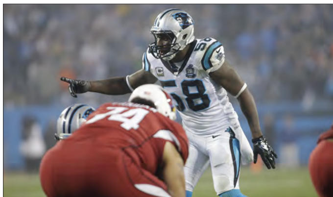
Linebacker Thomas Davis has averaged 130 tackles per season in the last four years and is the Panthers all-time leader with 954 tackles.

Davis has averaged 130 tackles per season over the last four seasons (521 from 2012-15), including a career-high 151 in 2013.