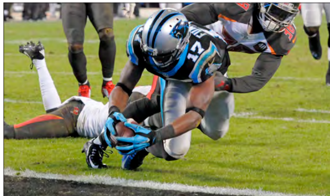
Wide receiver Devin Funchess recorded one of his five regular season touchdowns in Week Seventeen vs. Tampa Bay (1/3/16).