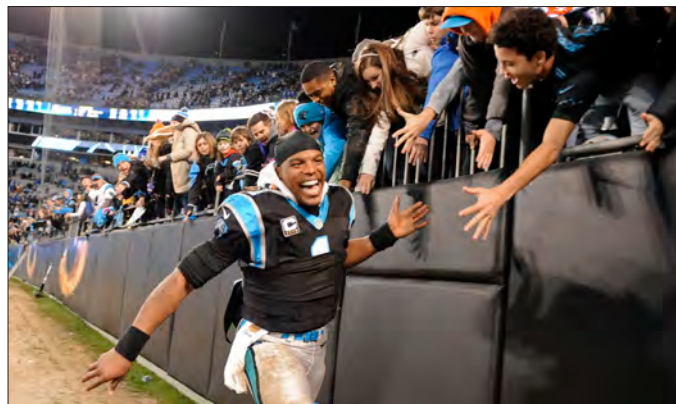
Quarterback Cam Newton celebrates with fans after the Panthers victory vs. Tampa Bay (1/3/16).