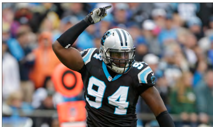
Defensive end Kony Ealy celebrates his sack of Packers quarterback Aaron Rodgers in Week Nine vs. Green Bay (11/8/15).

The five consecutive games with a sack is the longest such streak of his career. Ealy previously notched three consecutive games with a sack in the final three weeks of the 2014 regular season.