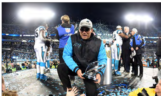
Head coach Ron Rivera holds the George S. Halas NFC Championship trophy after Carolina defeated Arizona, 49-15, in the NFC Championship game (1/24/16).

Rivera's commitment to running the ball and playing stout defense has led to success. The Panthers have produced 27 consecutive regular season games with at least 100 rushing yards, the longest active streak in the NFL. Carolina's defense has finished in the top 10 for four straight years.