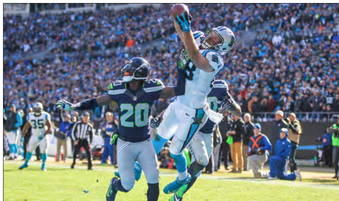
Greg Olsen is approaching the top 10 all-time among NFL tight ends for receiving yards and receiving touchdowns.