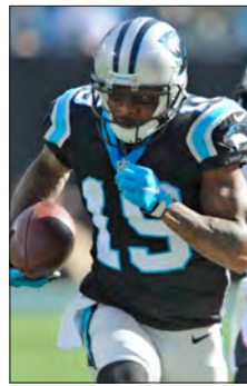
Ted Ginn, Jr.

In 2015, wide receiver Ted Ginn, Jr. led the Panthers with a career-high 10 touchdown catches. Ginn ranked second on the team with 44 receptions and 739 receiving yards. His 16.8-yard receiving average led the team and ranked eighth in the NFL.