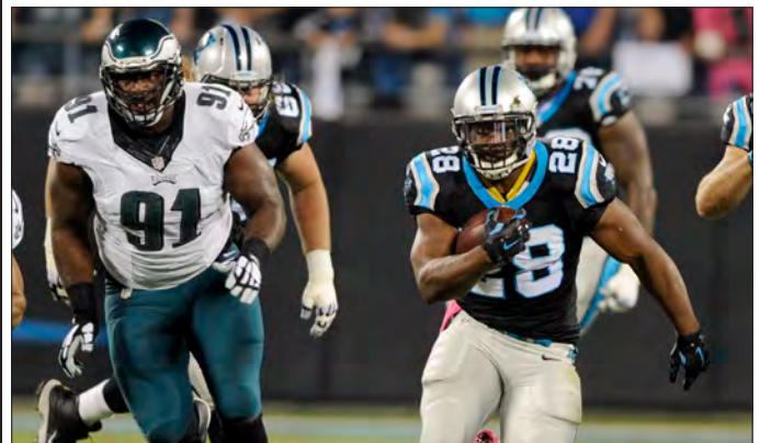
Running back Jonathan Stewart's 989 rushing yards in 2015 are the second-most of his career behind his 1,133 yards in 2009.

Stewart stands second in franchise history with 1,283 rushing attempts, 5,814 rushing yards and 13 regular season games with 100 or more rushing yards. He is third in team history with 36 career rushing touchdowns.