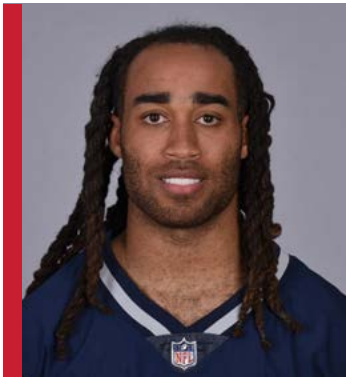
STEPHON GILMORE 3RD SELECTION