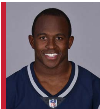
MATTHEW SLATER 8TH SELECTION

FOXBOROUGH, Mass. – Three members of the New England Patriots have been selected to the 2019 NFL Pro Bowl. Cornerback Stephon Gilmore, linebacker Dont'a Hightower and special teams captain Matthew Slater have been selected to represent the New England Patriots in the 2020 NFL Pro Bowl on Sun. Jan. 26, 2020, at Camping World Stadium in Orlando, Fla.