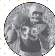
HUGH McELHENNY [515]