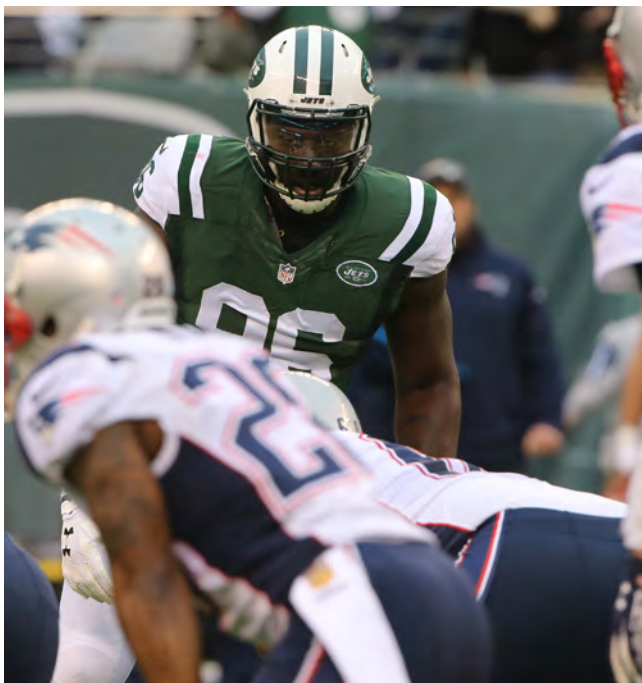
NEW YORK JETS vs. NEW ENGLAND PATRIOTS | 12|27|15