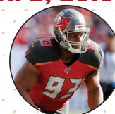
NDAMUKONG SUH [4]