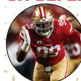
DeFOREST BUCKNER [4]