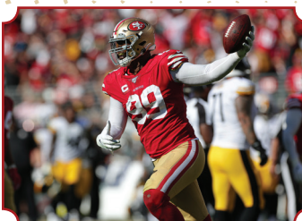
DeFOREST BUCKNER [2019]