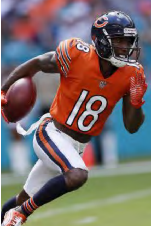
Bears WR Taylor Gabriel has 12 catches for 214 yards and 2 TDs over his past two games after recording consecutive 100-yard receiving games for the first time in his career.