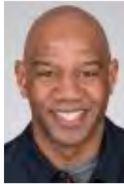
Charles London Running Backs