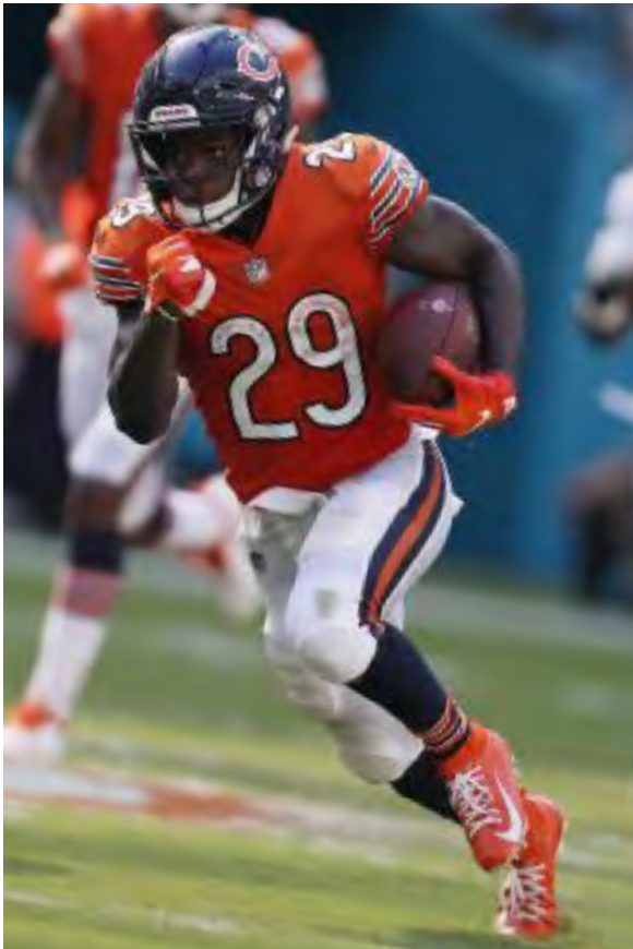
RB Tarik Cohen is fourth in the NFL among running backs with 51.8 receiving yards per game.