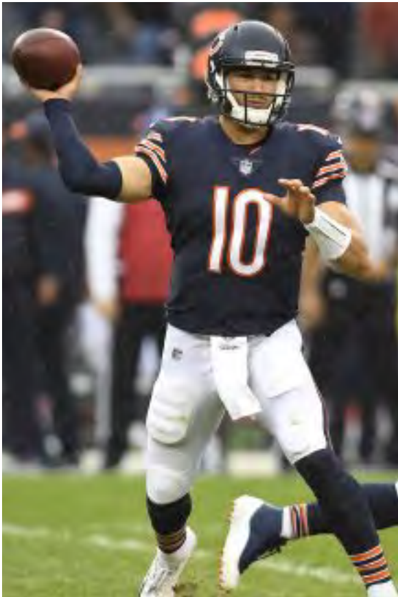
QB Mitchell Trubisky has totaled 770 yards of total offense over the past two games: 670 passing yards (9 TDs, 1 INT) and 100 yards rushing on 11 carries.

limited Tampa Bay's top-ranked offense to just 311 net yards and 10 points.