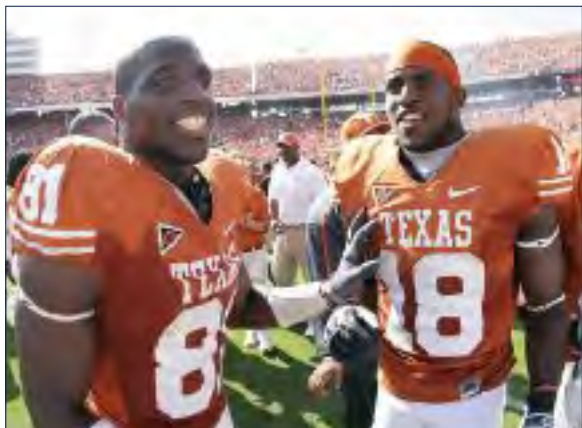
Sam (left) and Emmanuel (right) Acho

Following his playing days, Emmanuel has worked for both the Longhorn Network and Fox 7 as of recent, does public speaking, and hosts a podcast called Beyond the Film Room, which is about the abilities of athletes beyond sports. Acho also participated in a forum with the former Austin police chief meant to reduce divisions between the police and African-American communities.