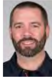
Kevin Gilbride Tight Ends