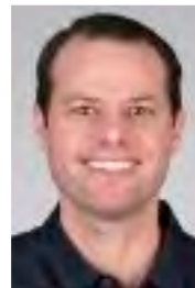
Brandon Staley Outside Linebackers