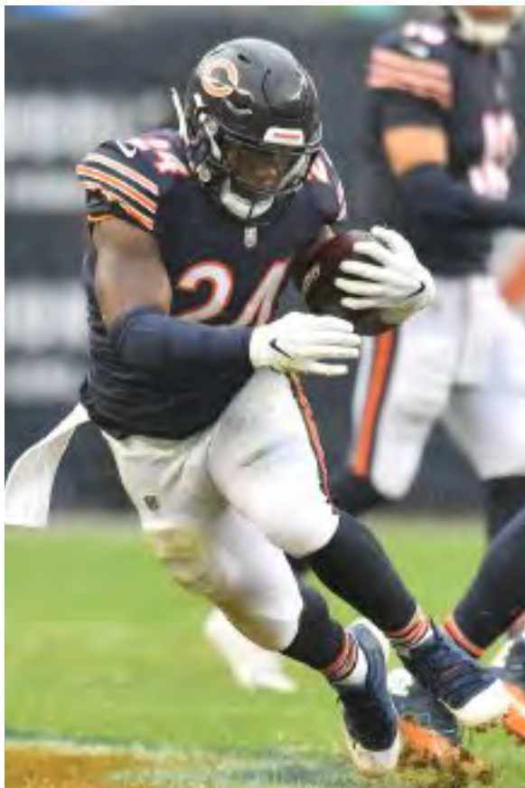
RB Jordan Howard leads Chicago's ground attack and is third in the NFL in rushing with 2,707 yards since the start of 2016.