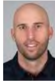
Dave Ragone Quarterbacks