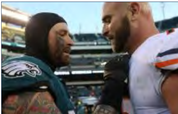
Chris (left) and Kyle (right) Long

Howard Jr. the youngest of three brothers, worked in the Oakland Raiders front office as a Player Personnel Assistant for five seasons.