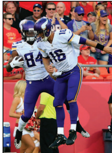
Lions QB Matt Cassel and Patriots WR Cordarrelle Patterson teamed up for the Vikings from 2013-14.

Lions WR Marvin Jones Jr. and Patriots RB Rex Burkhead were teammates with the Bengals from 2013-15. Lions RB LeGarrette Blount and Patriots DE Adrian Clayborn were teammates on the Buccaneers from 2011-12. In 2011, Blount lead the team with 781 rushing yards and Clayborn had a team-high 7.5 sacks. Lions QB Matt Cassel and Patriots WR Cordarrelle Patterson were teammates on the Vikings from 2013-14. On Dec. 8, 2013, Cassel and Patterson connected on five passes for 141 yards and a 79-yard touchdown reception, the most yards and longest reception Patterson has ever had in a game.