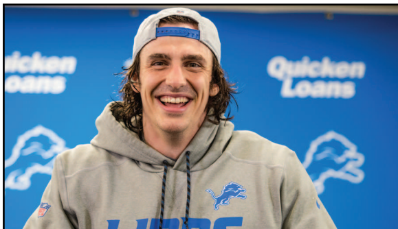
TE LUKE WILLSON

The three-time Super Bowl champion brings career totals of 116 games played, 5,888 rushing yards and 51 rushing TDs to the Lions offense in 2018.