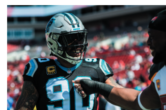
Three of the top four sack artists in NFL history played for the Panthers at one point in their career.

Julius Peppers is Carolina's all-time leader in forced fumbles (31), and had two in 2017. In his career, he has 49 forced fumbles, good for second in the NFL since 2000.