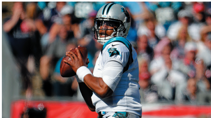
Quarterback Cam Newton threw for 316 yards and three touchdowns in Carolina's win at New England last season.

Rushing yards: 168, Richard Huntley at Carolina (1/6/02) Receiving yards: 104, Kelvin Benjamin at New England (10/1/17) Receptions: 7 (3x), most recently Devin Funchess at New England (10/1/17) Passing yards: 316, Cam Newton at New England (10/1/17)