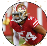
FRED WARNER [33]