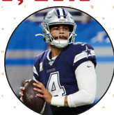
DAK PRESCOTT (1,098)