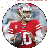
JIMMY GAROPPOLO (1,164)