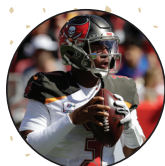
JAMEIS WINSTON (1,307)