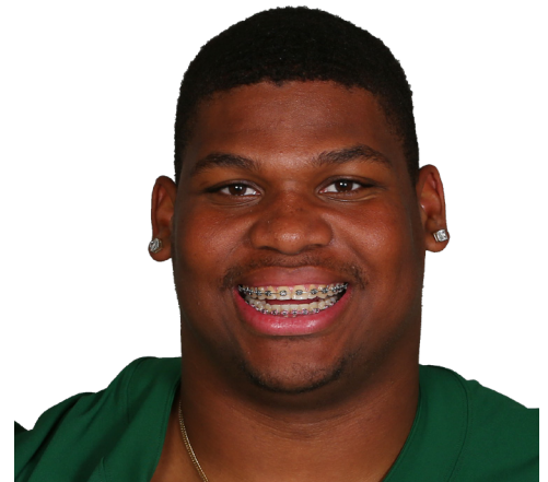
95 QUINNEN WILLIAMS