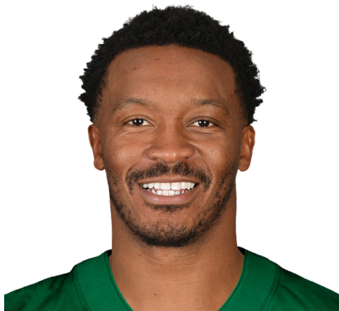
18 DEMARYIUS THOMAS