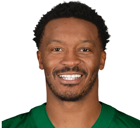
18 DEMARYIUS THOMAS