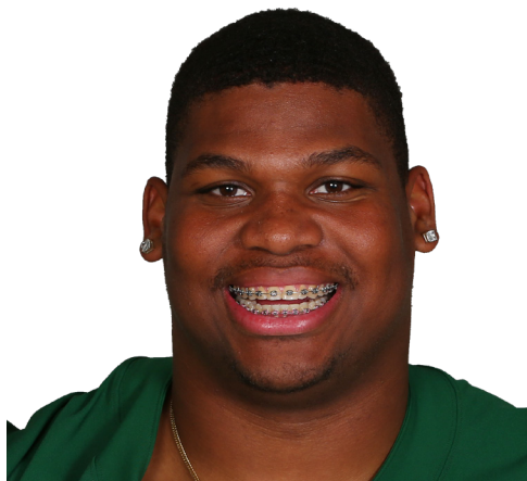
95 QUINNEN WILLIAMS