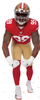
DEFOREST BUCKNER (3.0 SACKS)