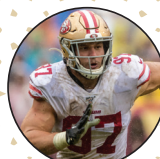
NICK BOSA (4)