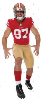
NICK BOSA (4.0 SACKS)