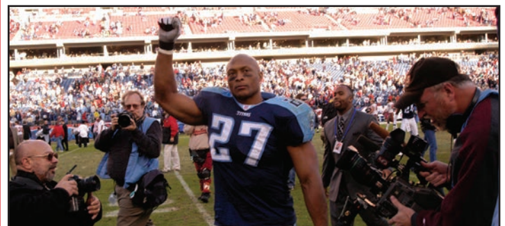
Eddie George salutes the fans following his final home game as a Titan.

October 9 – Head Coach Jeff Fisher becomes the 34th coach in NFL history and the first in franchise history to notch 100 wins as the Titans win at Houston by a score of 34-20. Also in the game, quarterback Steve McNair became the 49th player in NFL history and second player in franchise history to reach 25,000 career passing yards.