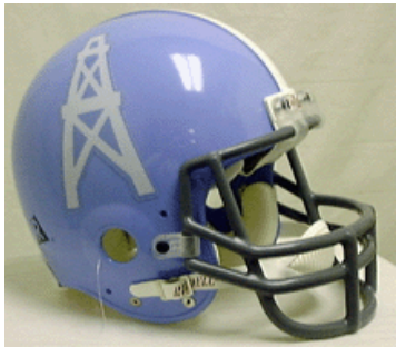
The original Houston Oilers helmet from 1960-65 was blue with a white stripe down the middle.

The original Oilers helmet, circa 1960, was blue with a white stripe down the middle. The oil derrick logo was also white. Although the derrick itself remained, many subtle changes were made to the helmets over the years. In 1964, two red stripes were added to the white striping on top of the helmet. Two years later, the helmet color was changed to silver with red and blue striping. The derrick, meanwhile, was changed to blue with a red outline and white background. In 1972, the helmet color was switched back to blue with red and white striping, while the derrick was changed to white with a red outline. Three years later, the helmet color was changed to its familiar white with red and blue striping. The derrick was then switched to blue with a red outline. The helmets boasted a gray facemask. In 1981, the facemask was switched to red. In 1997, the Oilers added the Tennessee logo to the back of their helmet upon their relocation to Nashville. In 1999, the franchise unveiled a new logo as the team was renamed the Tennessee Titans.