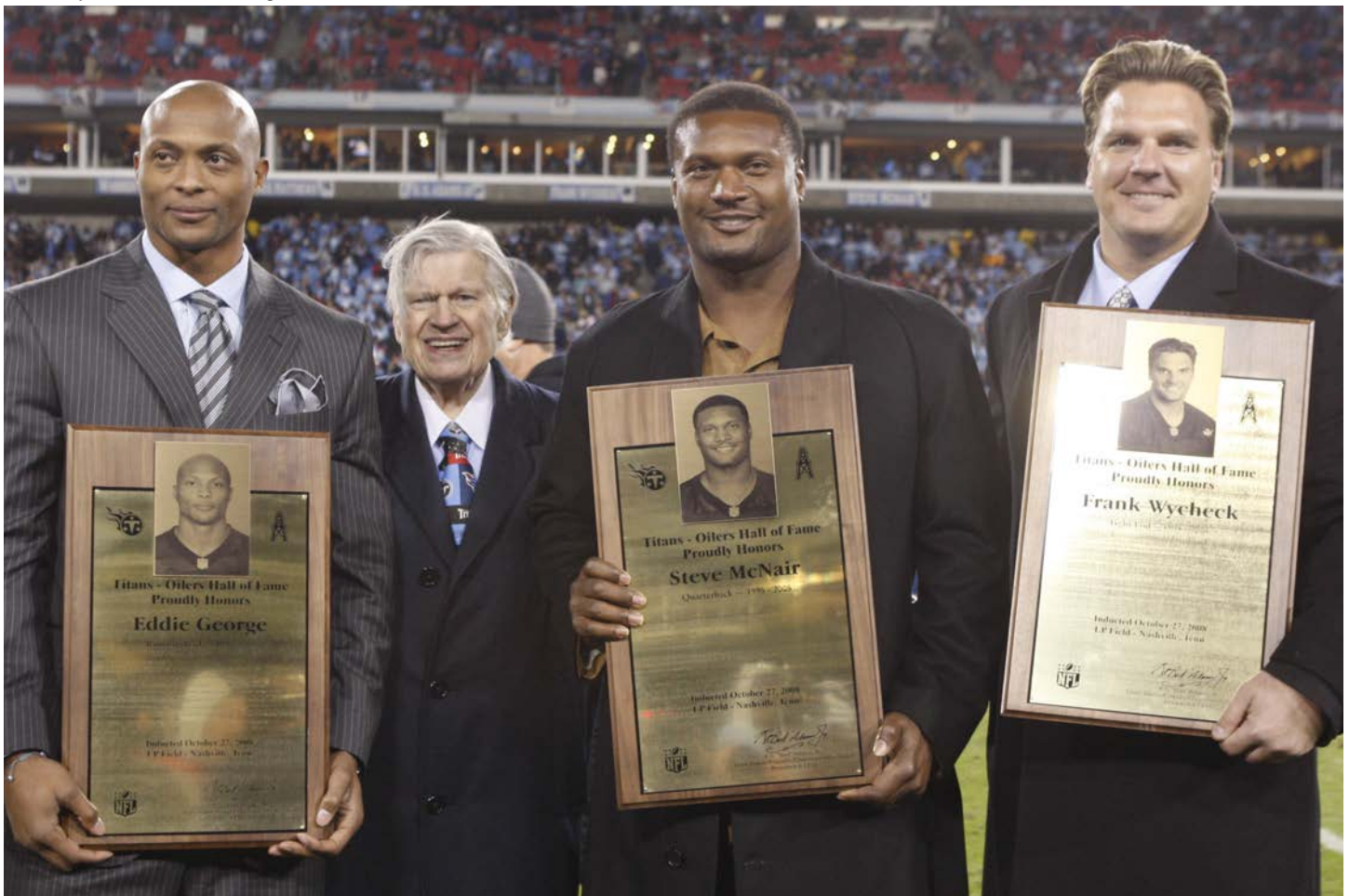
Eddie George, Steve McNair and Frank Wycheck were inducted into the team's Hall of Fame and Ring of Honor during the 2008 season.