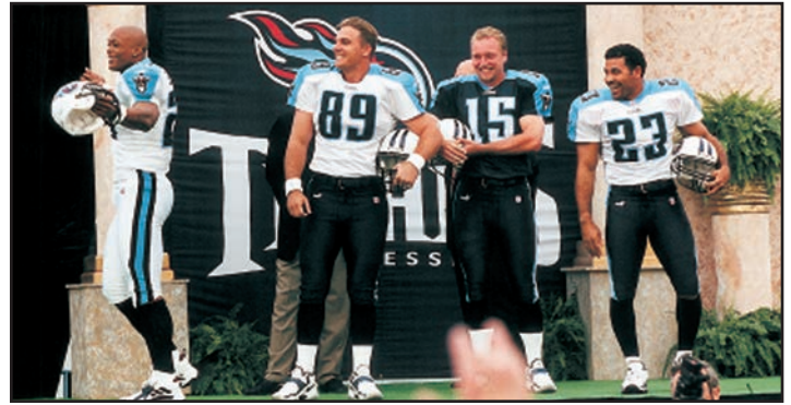
Eddie George, Frank Wycheck, Craig Hentrich and Blaine Bishop model the Titans' new uniforms in 1999.

August 15 – The Tennessee franchise plays its first preseason game under the name Titans, a 22-20 loss at Kansas City. The game is the first in franchise history played in a uniform other than the Oilers.