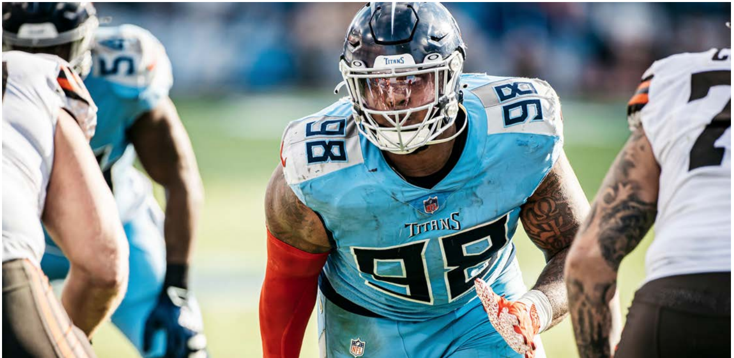
The Titans drafted Jeffery Simmons in the first round of the 2019 NFL Draft.