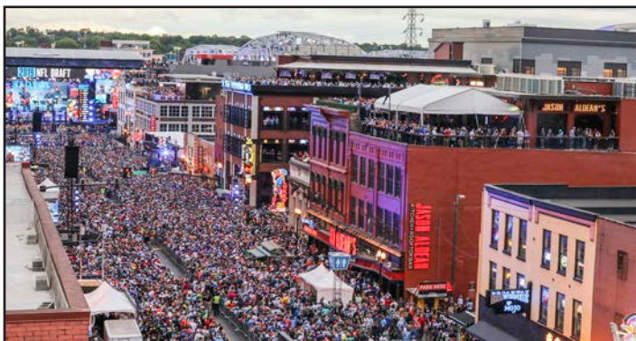
The 2019 NFL Draft was held in downtown Nashville.

April 25-27 – The 2019 NFL Draft is held in downtown Nashville. Nashville shatters a draft record with more than 600,000 fans attending during the three-day event and sets another draft record with more than 47.5 million television viewers. For the city of Nashville, the event generated a record $133 million in direct spending, a 79 percent increase over the previous draft in Dallas ($74 million). The economic impact was another record-breaker at $224 million, also a 79 percent increase over the $125 million in 2018.