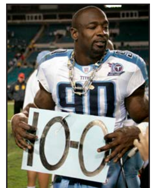
Jevon Kearse celebrates the Titans' 10-0 start in 2008.

December 16 – Six Titans are selected to the Pro Bowl – center Kevin Mawae, left tackle Michael Roos, running back Chris Johnson, defensive tackle Albert Haynesworth, safety Chris Hope and