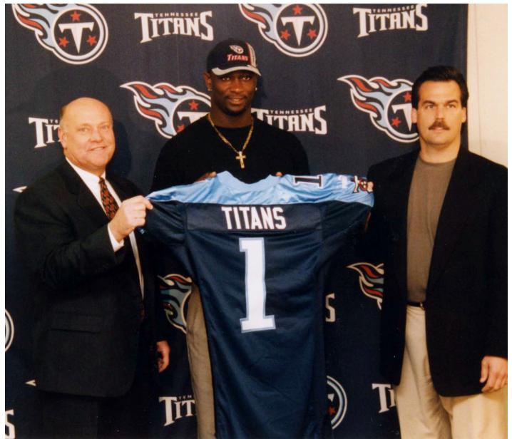
Jevon Kearse was selected in the first round of the 1999 NFL Draft.