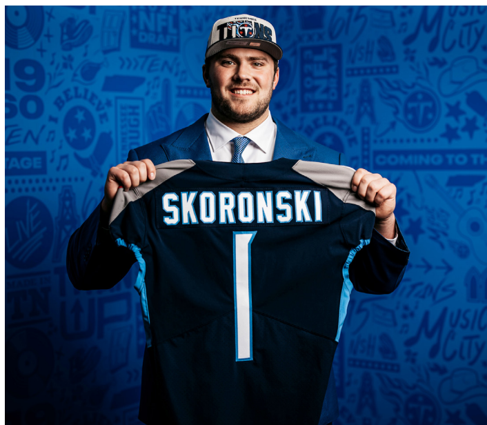
Peter Skoronski was the 11th overall selection in the 2023 NFL Draft.

* Opponent based on final division standings in 2025.