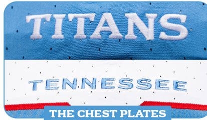
THE CHEST PLATES

Our primary logo, "The Shield" adorns the side of the helmet, while the 6-String Stripe runs down the center. The helmet's clean, white shell is paired with an all-white face mask.