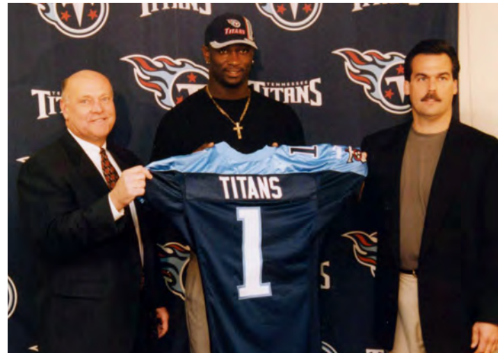
Jevon Kearse was the 16th overall selection in the 1999 NFL Draft.