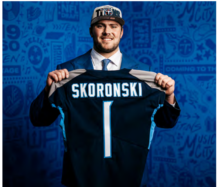
Peter Skoronski was the 11th overall selection in the 2023 NFL Draft.