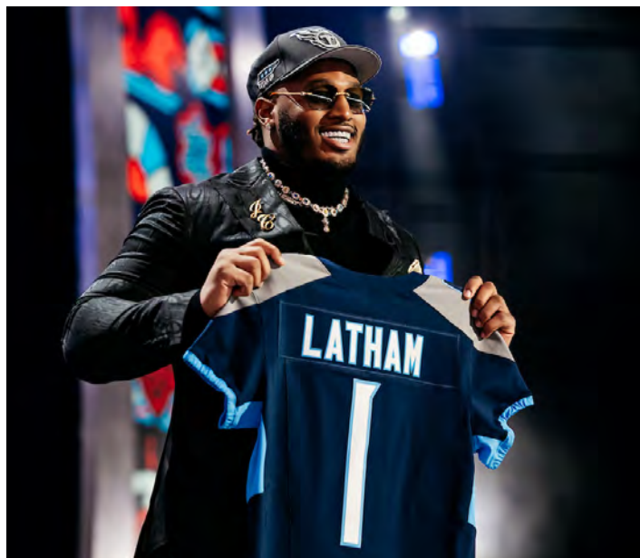
The Titans drafted JC Latham with the seventh overall pick in the 2024 NFL Draft.

In determining draft order, non-playoff clubs select first through 18th, according to the reverse order of their standing (i.e., the team with the lowest winning percentage receives the first pick, the team with the second-lowest winning percentage receives the second pick, etc.). Playoff teams select