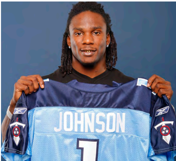
Chris Johnson was the 24th overall selection in the 2008 NFL Draft.