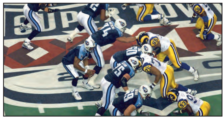
The Titans battle the Rams at Super Bowl XXXIV in Atlanta.

January 30 - The Titans fall short in their quest to win Super Bowl XXXIV. as Kevin Dyson is stopped one yard short of the end zone on the final play of the game in a 23-16 St. Louis Rams victory.