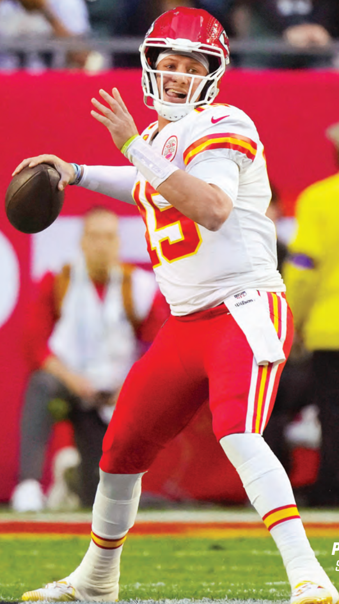
PATRICK MAHOMES SUPER BOWL LVII MVP