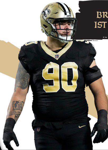
BRYAN BRESEE 1ST ROUND: 2023