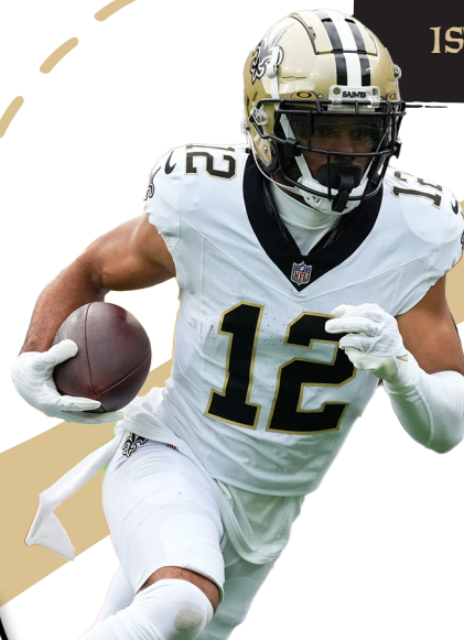
CHRIS OLAVE 1ST ROUND: 2022

Round 1: Defensive Tackle Bryan Bresee –