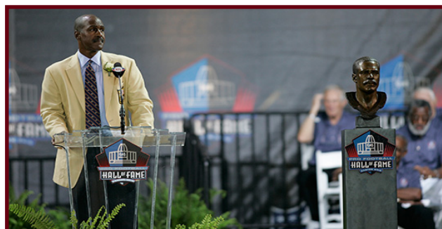
Art Monk (Class of 2008)