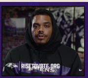
T Ronnie Stanley