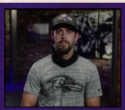
K Justin Tucker