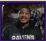
DE Calais Campbell