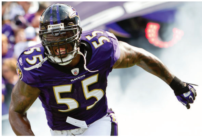
OLB Terrell Suggs was named the 2011 AP NFL Defensive Player of the Year.

Baltimore Ravens (1996-2003), Modell directed teams that produced 28 winning seasons, 28 playoff games, two NFL Championships (1964 and 2000), three other appearances in NFL title contests (1965, '68 and '69) and four visits (1986, '87, '89 and 2000) to AFC championships.