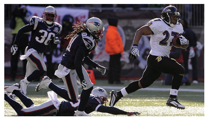
RB Ray Rice bolted for an 83-yard TD run on the first play from scrimmage in the Ravens' Wild Card win over New England during the 2009 playoffs.

1/9 - In the Wild Card game at Kansas City, the Ravens prevailed 30-7, becoming the only NFL team to win at least