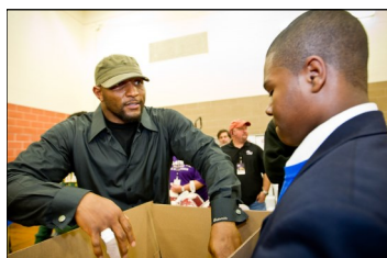
LB Ray Lewis donates Thanksgiving baskets.

The Ravens were particularly active throughout the holidays. The week of Thanksgiving included six events and 18 players donating food, funds and time to feed 1,800 Baltimore-area families.