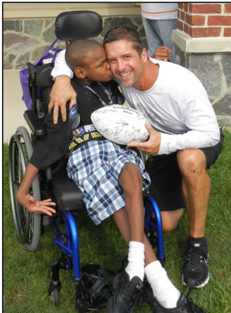
Head Coach John Harbaugh