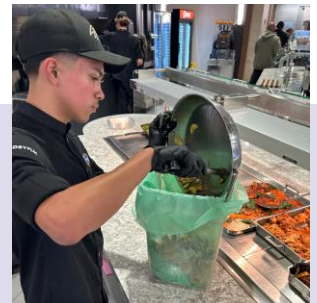
food scrap composting in dining room