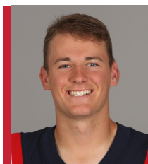
MAC JONES 1ST PRO BOWL SELECTION PFWA-ALL ROOKIE TEAM