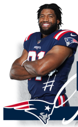
DEATRICH WISE JR.