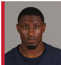
J.C. JACKSON 1ST PRO BOWL SELECTION 1ST ALL-PRO SELECTION PFWA-ALL AFC TEAM