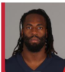
MATTHEW JUDON 3RD PRO BOWL SELECTION PFWA-ALL AFC TEAM