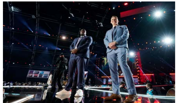
Christian Barmore (left) and Mac Jones (right) at the 2021 NFL Draft