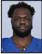
KWITY PAYE DEFENSIVE END HEIGHT: 6-3 WEIGHT: 265 COLLEGE: MICHIGAN DRAFT PICK: 1ST ROUND (21ST OVERALL)

Paye played in 38 games (20 starts) at Michigan (2017-20) and tallied 100 tackles (56 solo), 23.5 tackles for loss, 11.5 sacks, one pass defended, one forced fumble and one fumble recovery. He was a three-time Academic All-Big Ten honoree (2018-20).